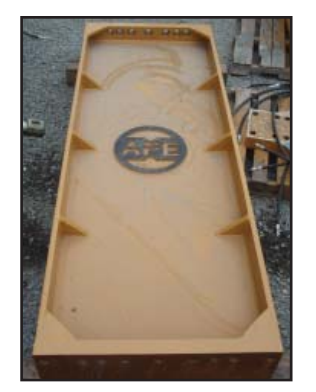
8' attachment extension.