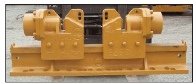
APE caisson beam & APE Model 200 caisson clamps.